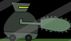
FATSO WITH CHAINSAW

Now there's a real killing machine. A fatso with a chainsaw! This guy takes a lot of damage and it will try to ram its rusty chainsaw at you whenever it can. It will even turn around, if you try to attack it from behind. Avoid its chainsaw, or you will be ripped to pieces in no time.